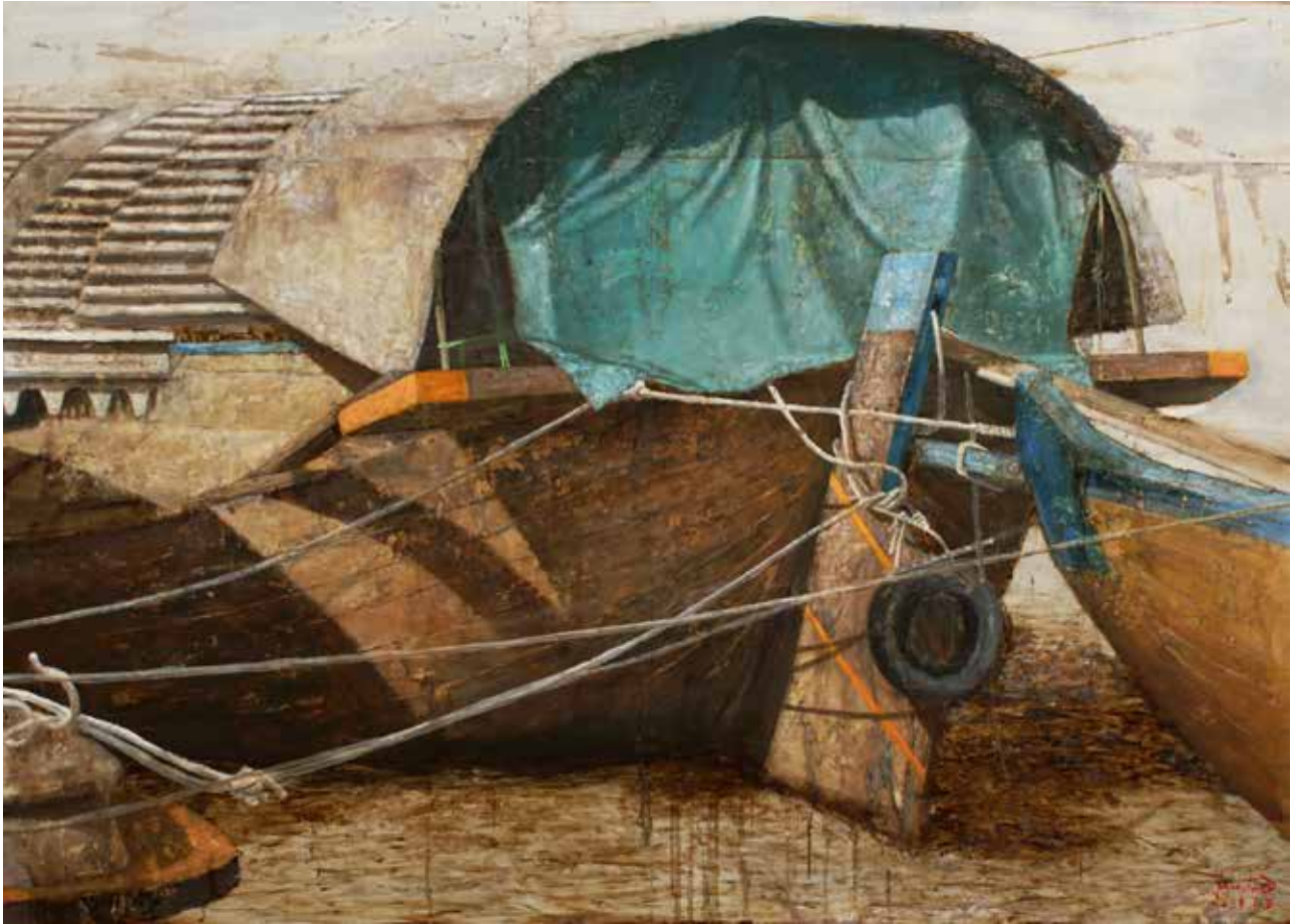
Therdkiat Wangwatcharakul | Memory of the River (6) , 2013 | Oil on aluminium sheets | 170 x 122 cm