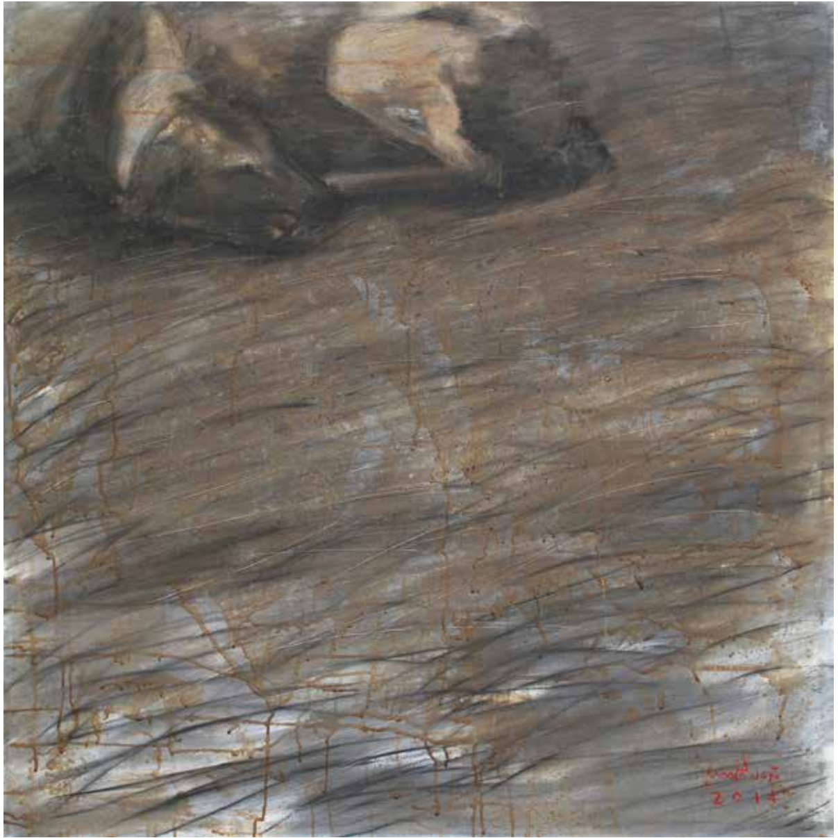
Therdkiat Wangwatcharakul | Sleep Well (1) , 2014 | Pastel on canvas | 100 x 100 cm