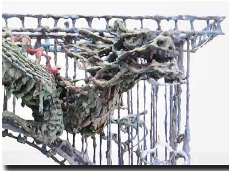
Rattana Salee | Dragon Arch , 2015 | Steel, epoxy and paint | 130 x 150 x 50 cm