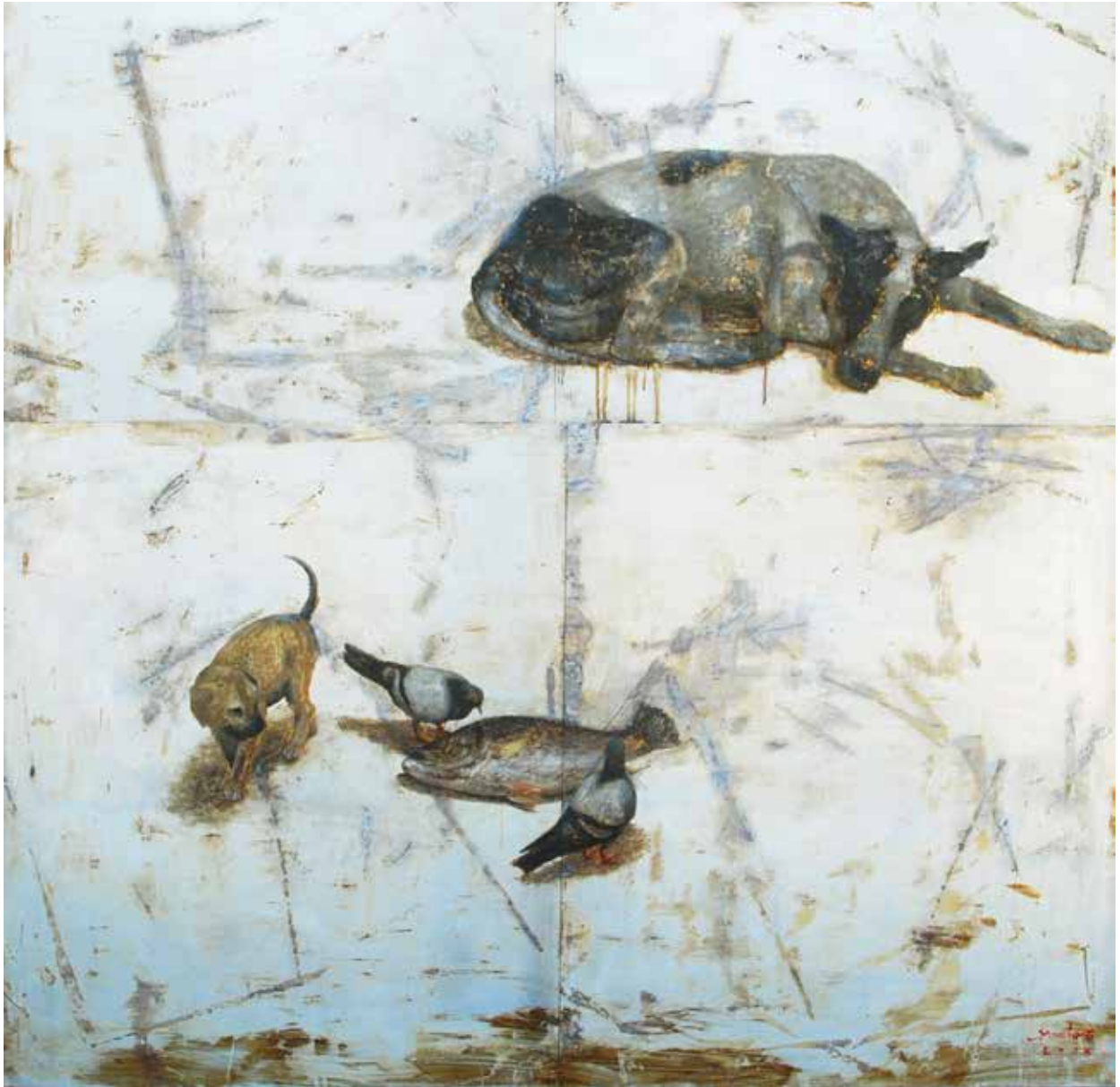
Therdkiat Wangwatcharakul | Dog and Fish , 2013 | Oil on aluminium sheets | 170 x 165 cm