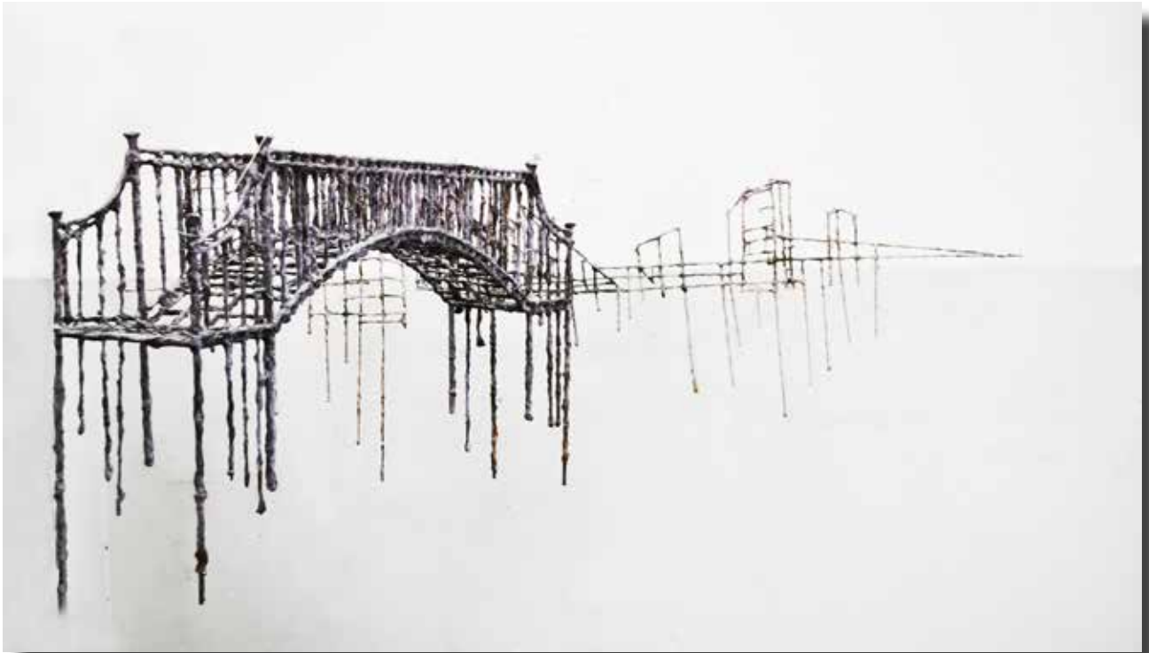
Rattana Salee | Torn Bridge , 2015 | Steel, epoxy and paint | 200 x 95 x 25 cm