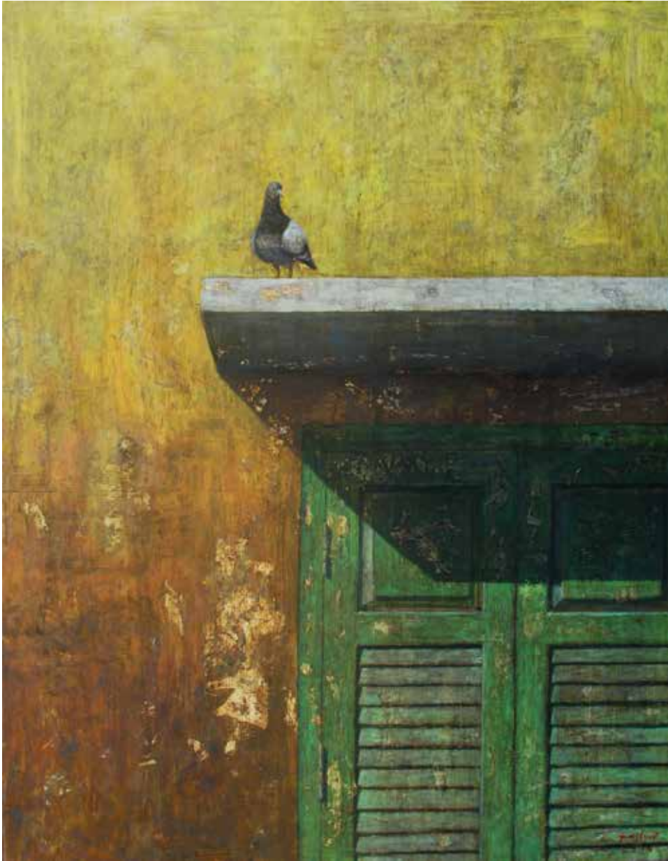
Therdkiat Wangwatcharakul | Alone Again , 2015 | Oil on aluminium sheets | 140 x 180 cm