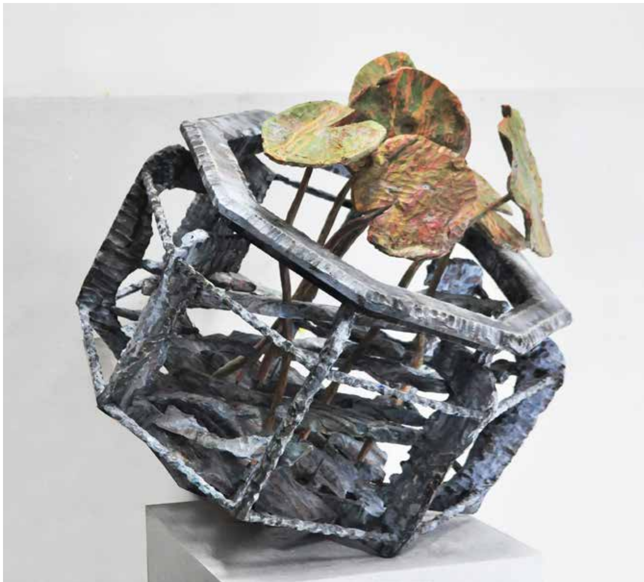
Rattana Salee | A Gift from Grandfather , 2014 | Wood carving, paint | 53 x 53 x 60 cm