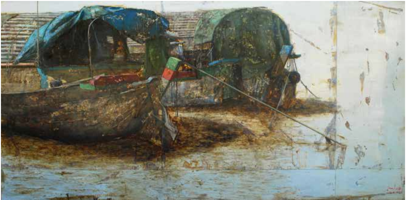
Therdkiat Wangwathcarakul | Memory of the River #8

I don't want to convey likeness but express my feelings towards objects and space, some of which are no longer here. The obscurity of representation, relying on (contour) lines rather than its solidity, enhances the ability of the work to communicate subjective feelings, private emotions and temporal dimension.