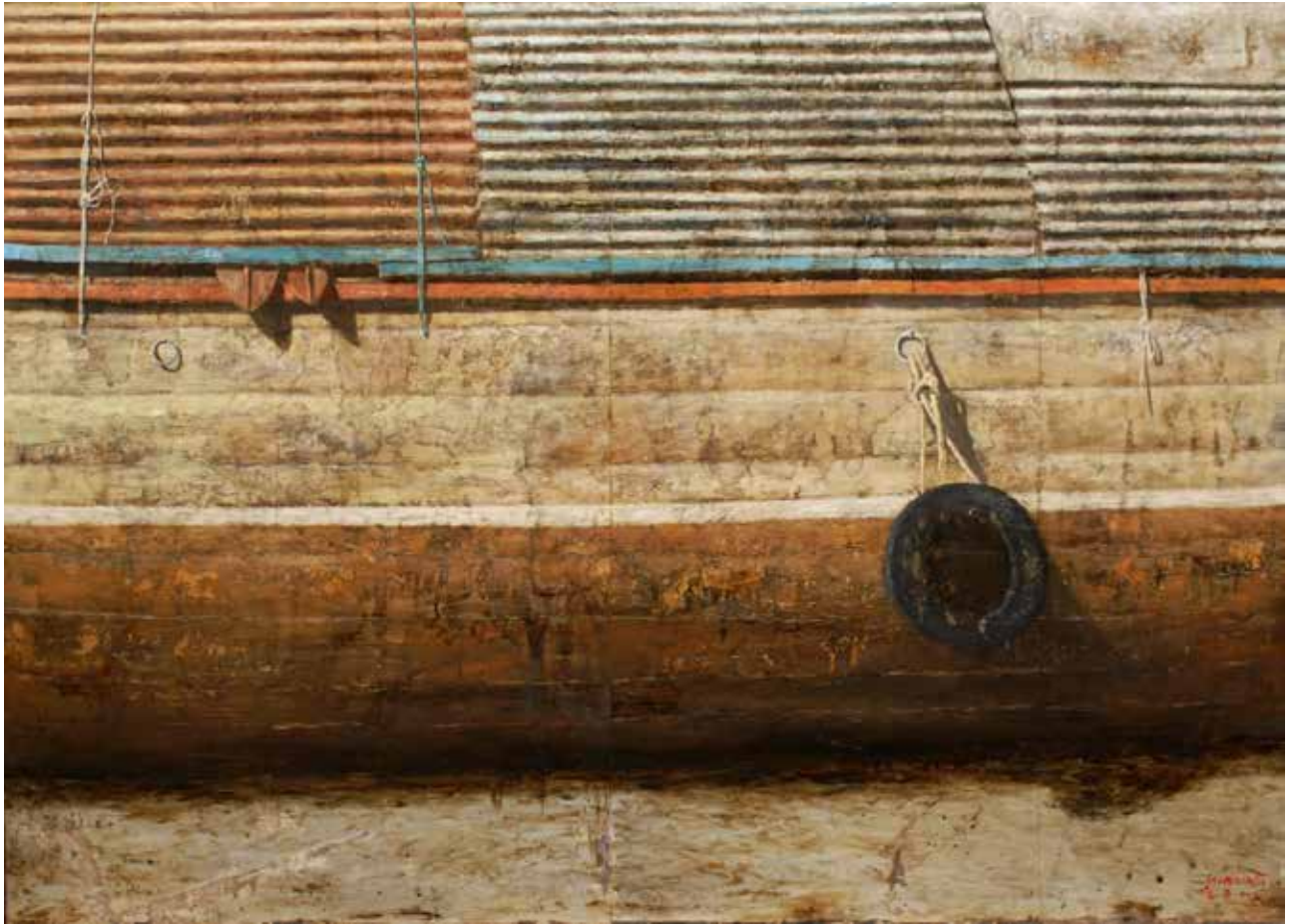
Therdkiat Wangwatcharakul | Memory of the River (7) , 2013 | Oil on aluminium sheets | 170 x 122 cm