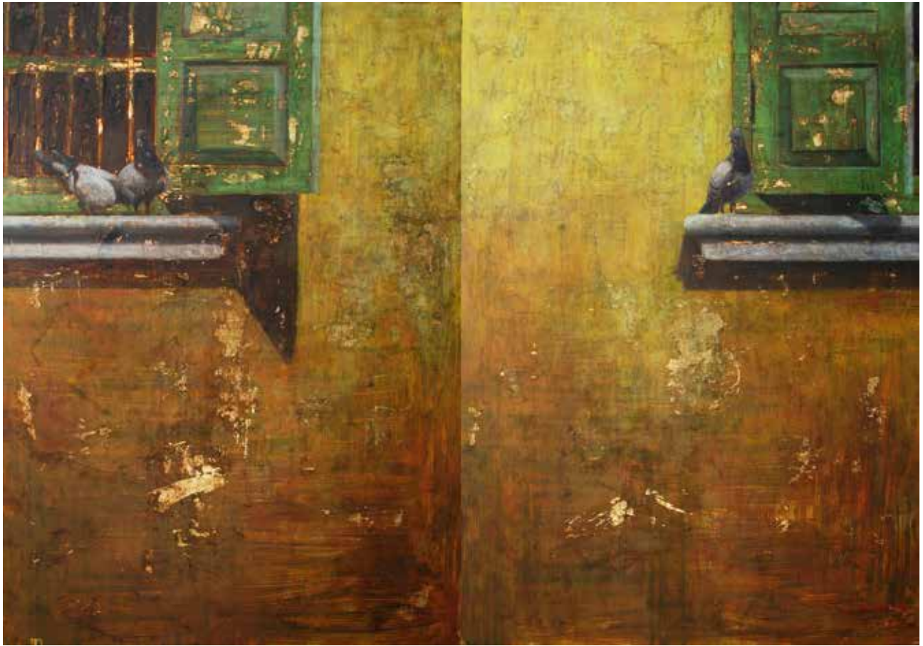
Therdkiat Wangwatcharakul | Three Birds , 2015 | Oil on aluminium sheets | 200 x 140 cm (2 panels)