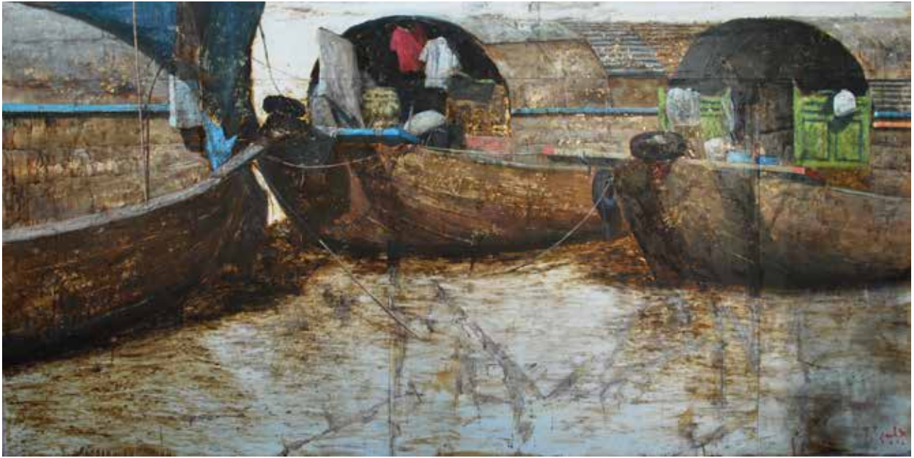
Therdkiat Wangwatcharakul | Memory of the River (9) , 2012 | Oil on aluminium sheets | 243 x 120 cm