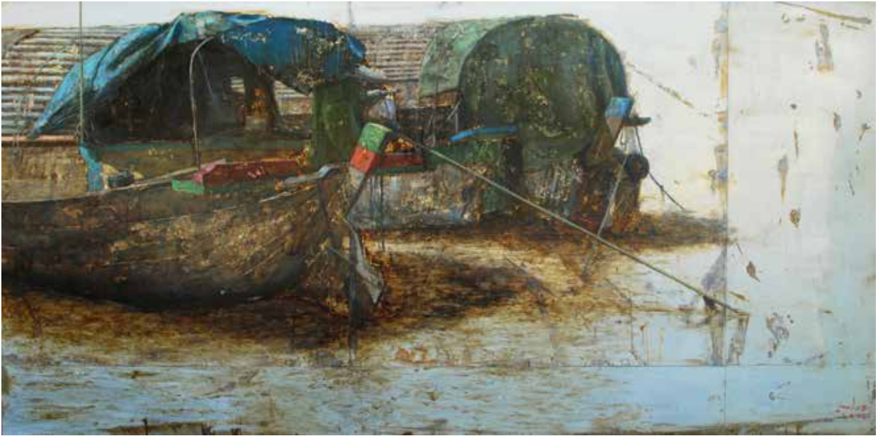
Therdkiat Wangwatcharakul | Memory of the River (8) , 2012 | Oil on aluminium sheets | 243 x 120 cm