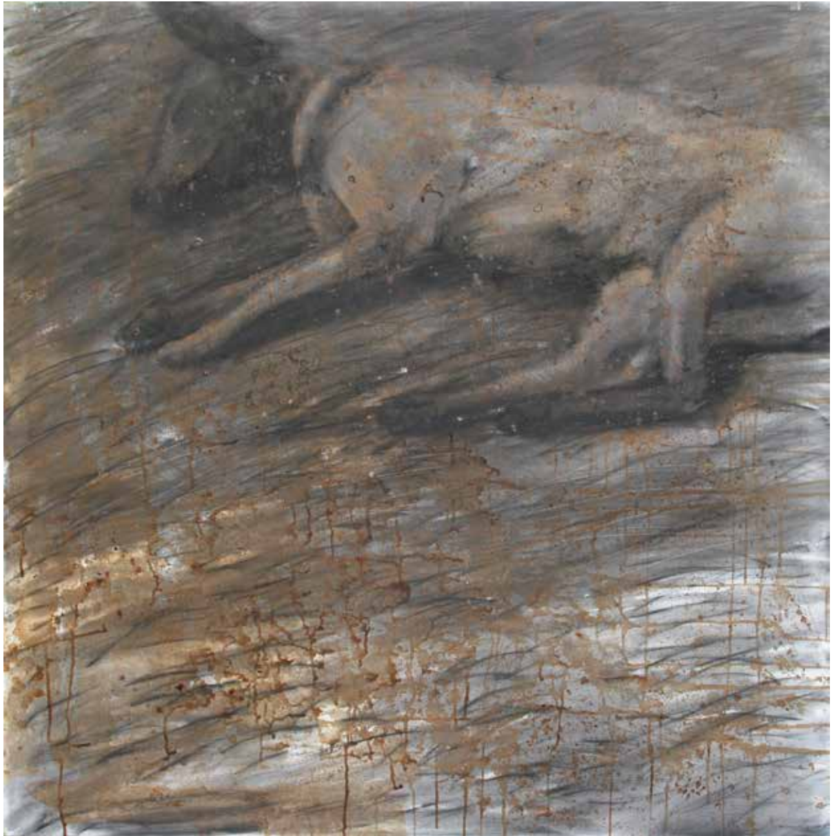
Therdkiat Wangwatcharakul | Sleep Well (2) , 2014 | Pastel on canvas | 100 x 100 cm