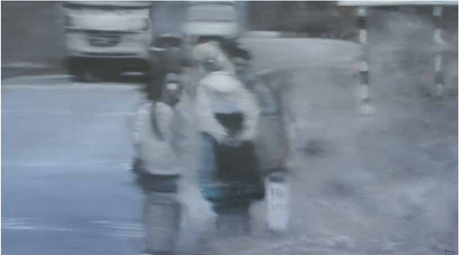
The Road To Lao Cai, 2013 | Oil on canvas | 158 x 89 cm