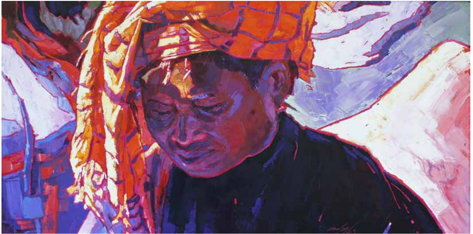
Market Day, 2013 | Oil on canvas | 153 x 76 cm