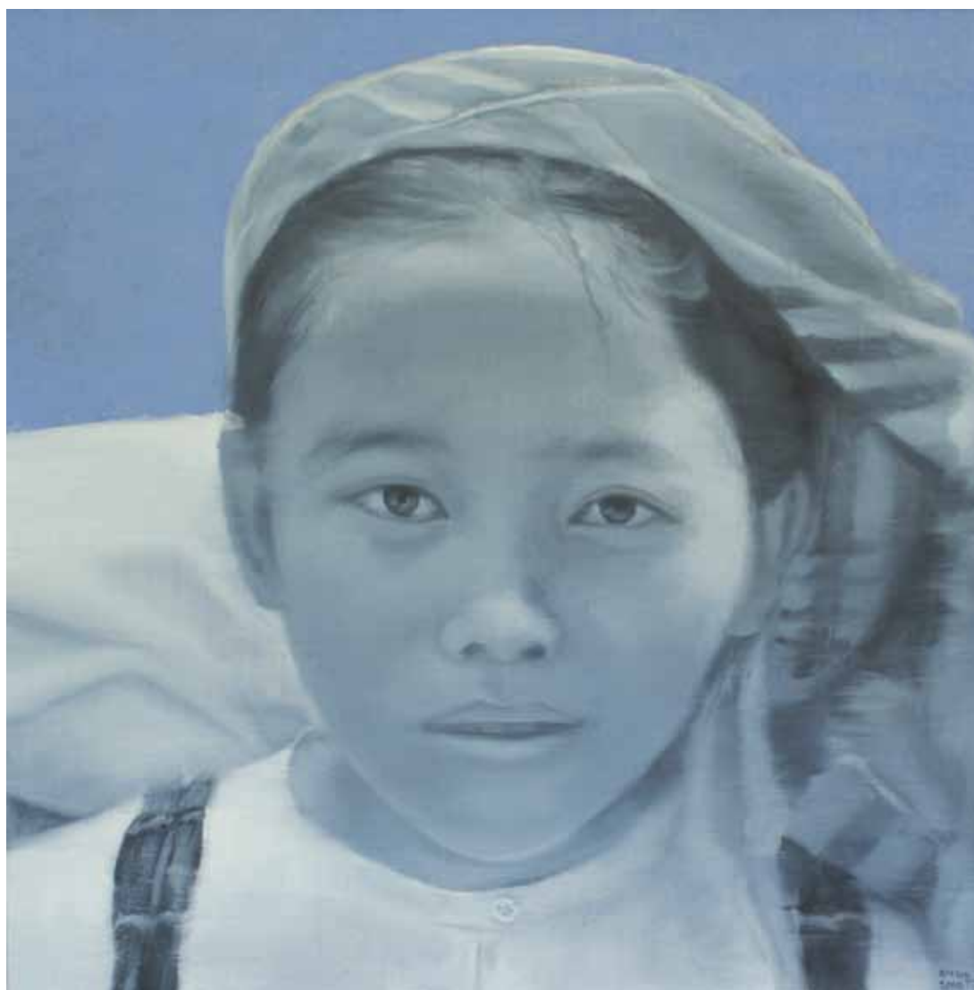
Hmong Girl At Meo Vac, 2010 | Oil on canvas | 98 x 98cm