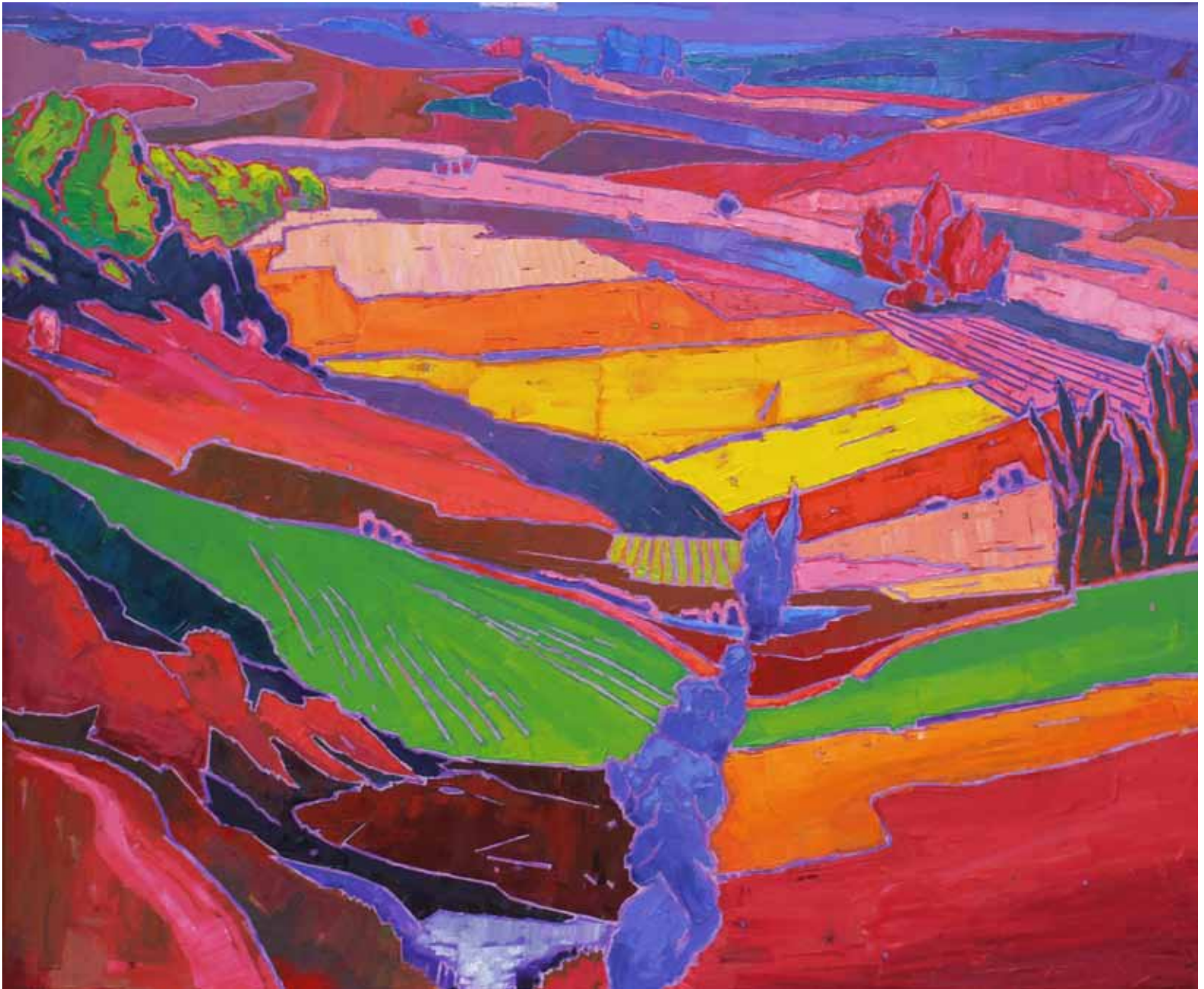
Orchestra Of Colours, 2013 | Oil on canvas | 183 x 153 cm