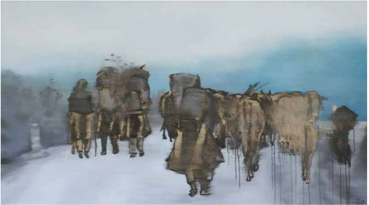
The Road Home, 2013 | Oil on canvas | 158 x 89 cm