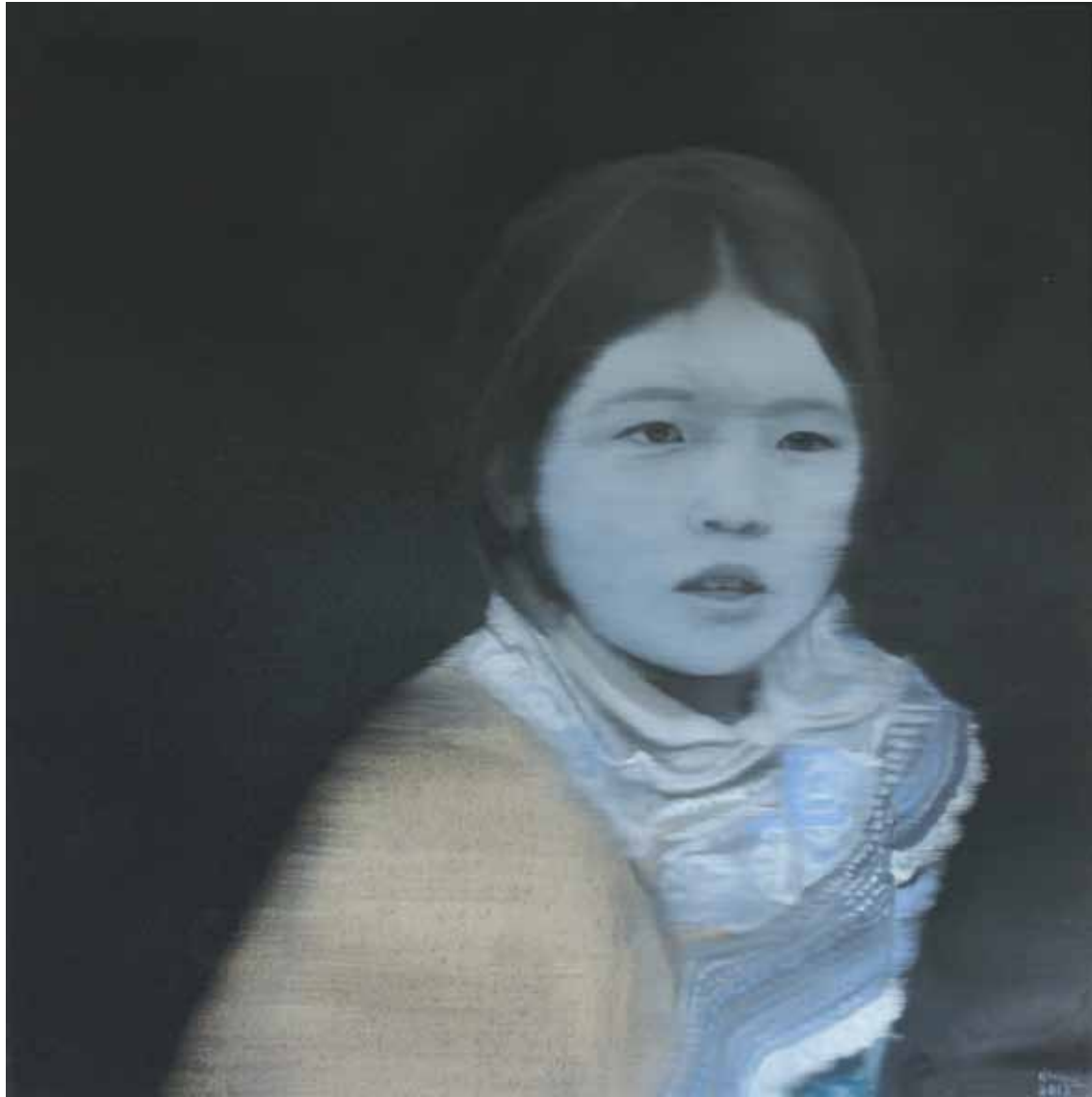
Young Hmong Girl, 2012 | Oil on canvas | 88 x 88 cm