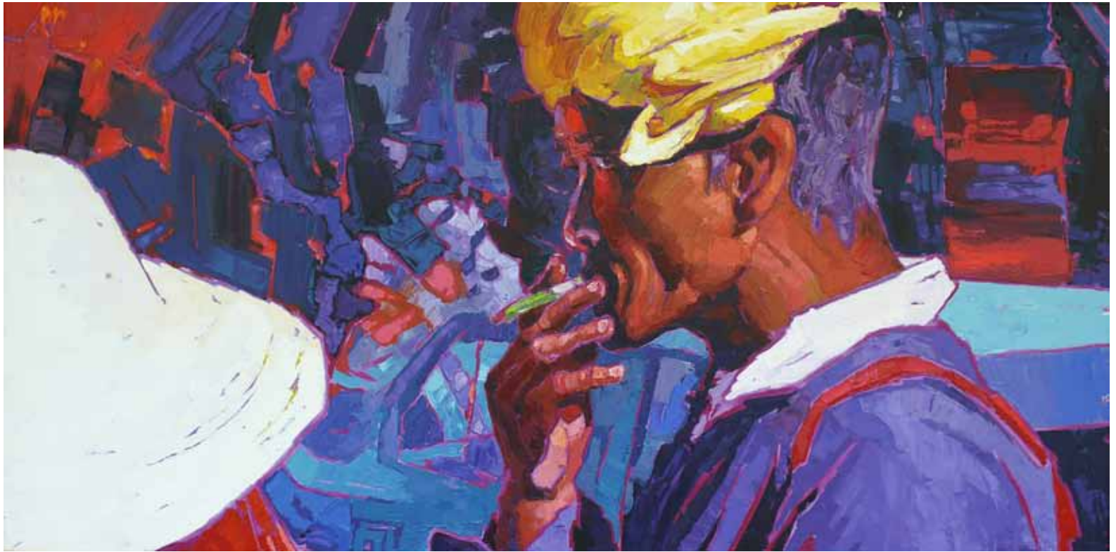
Cheerot, 2013 | Oil on canvas | 153 x 76 cm