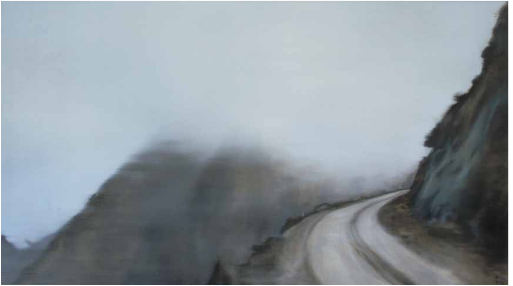
The Road To Meo Vac, 2013 | Oil on canvas | 158 x 89 cm