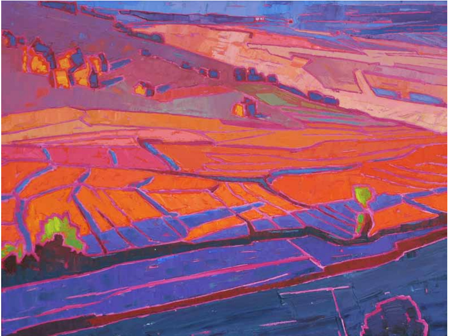
Shadows , 2013 | Oil on canvas | 122 x 92 cm