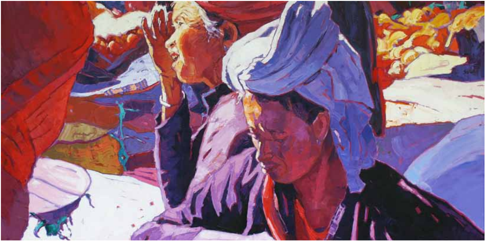
Corner Of The Day, 2013 | Oil on canvas | 153 x 76 cm