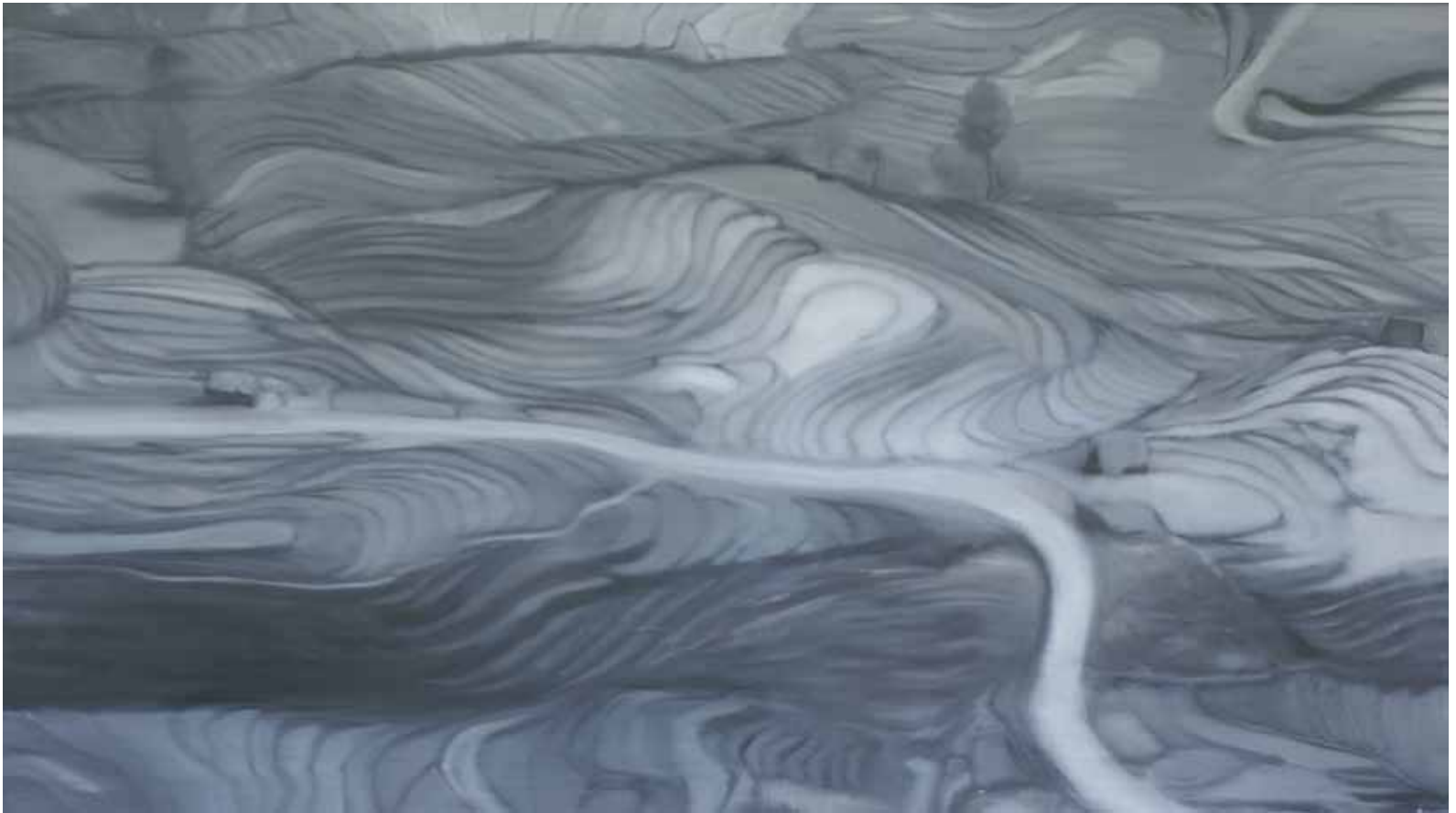
The Road To Y Ty, 2013 | Oil on canvas | 158 x 89 cm