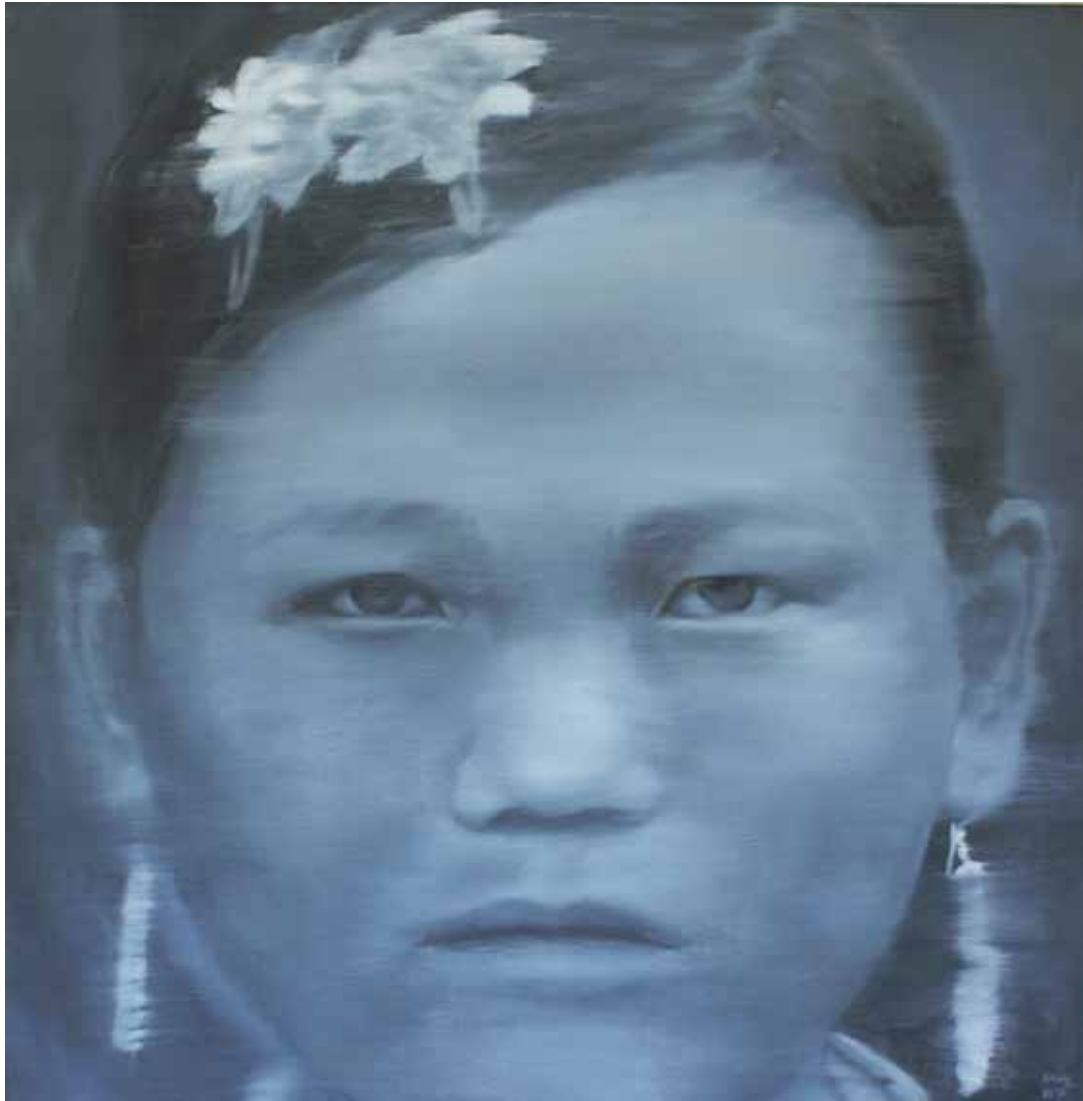
Hmong Girl In The Market, 2010 | Oil on canvas | 98 x 98 cm