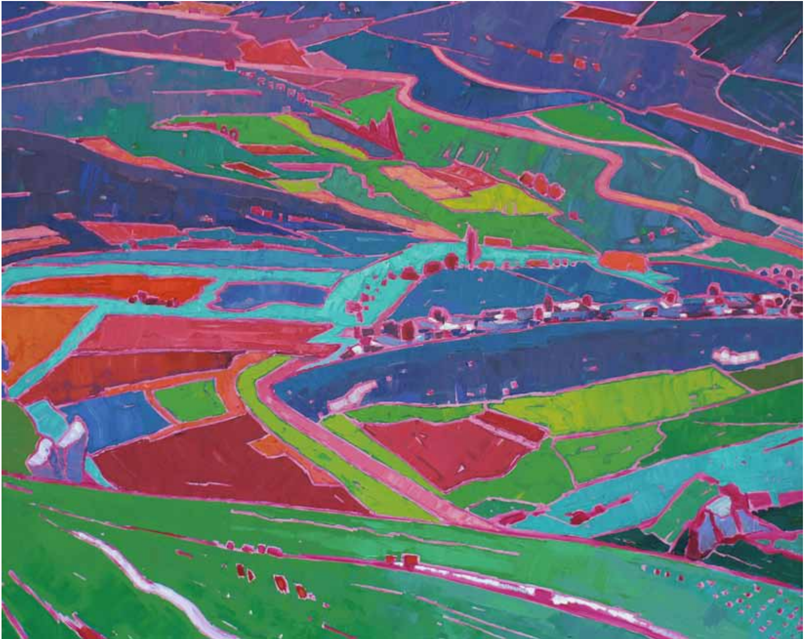
Ringing With Colours, 2013 | Oil on canvas | 183 x 122 cm