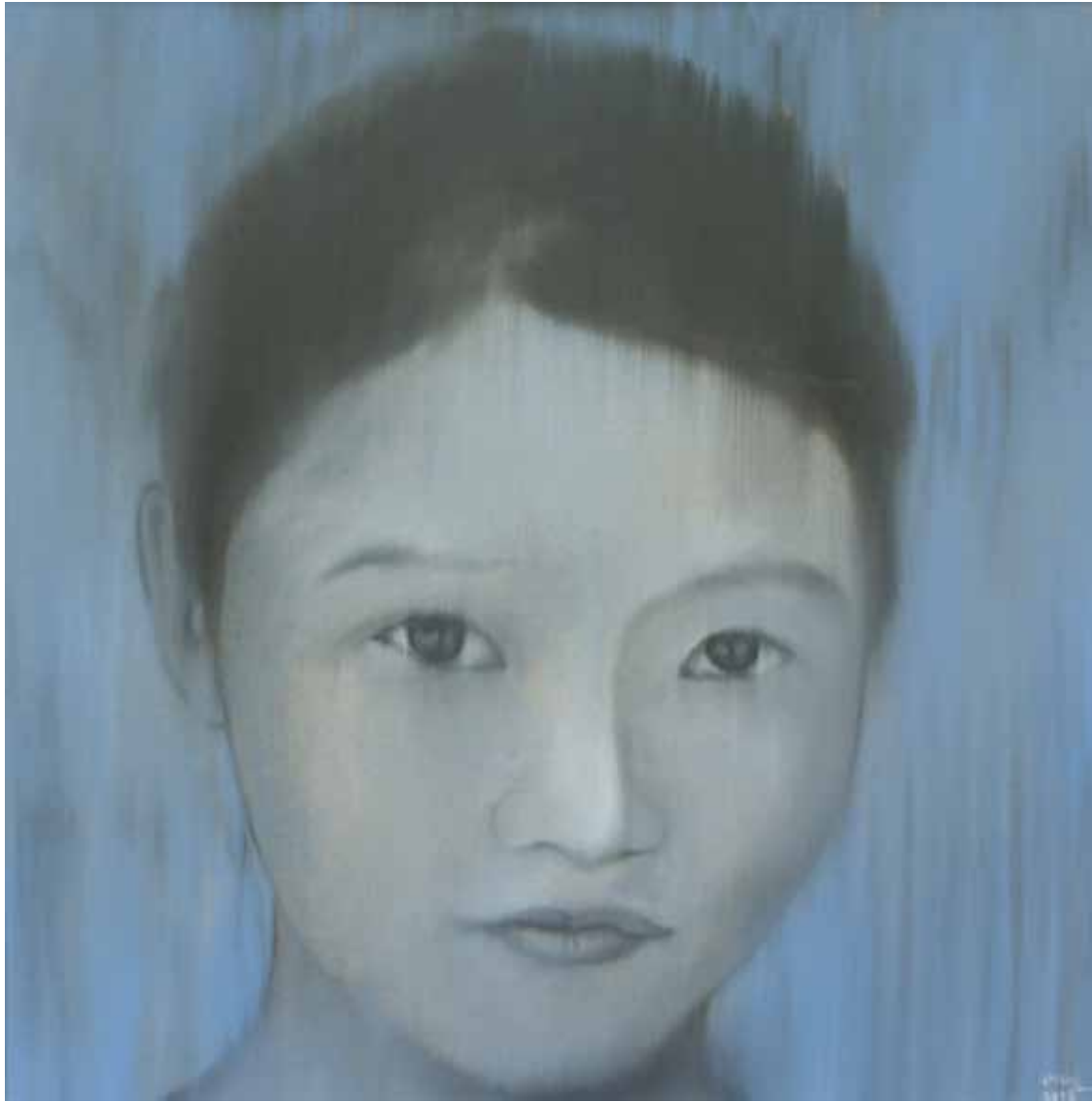
Hmong Girl At Home, 2012 | Oil on canvas | 88 x 88 cm