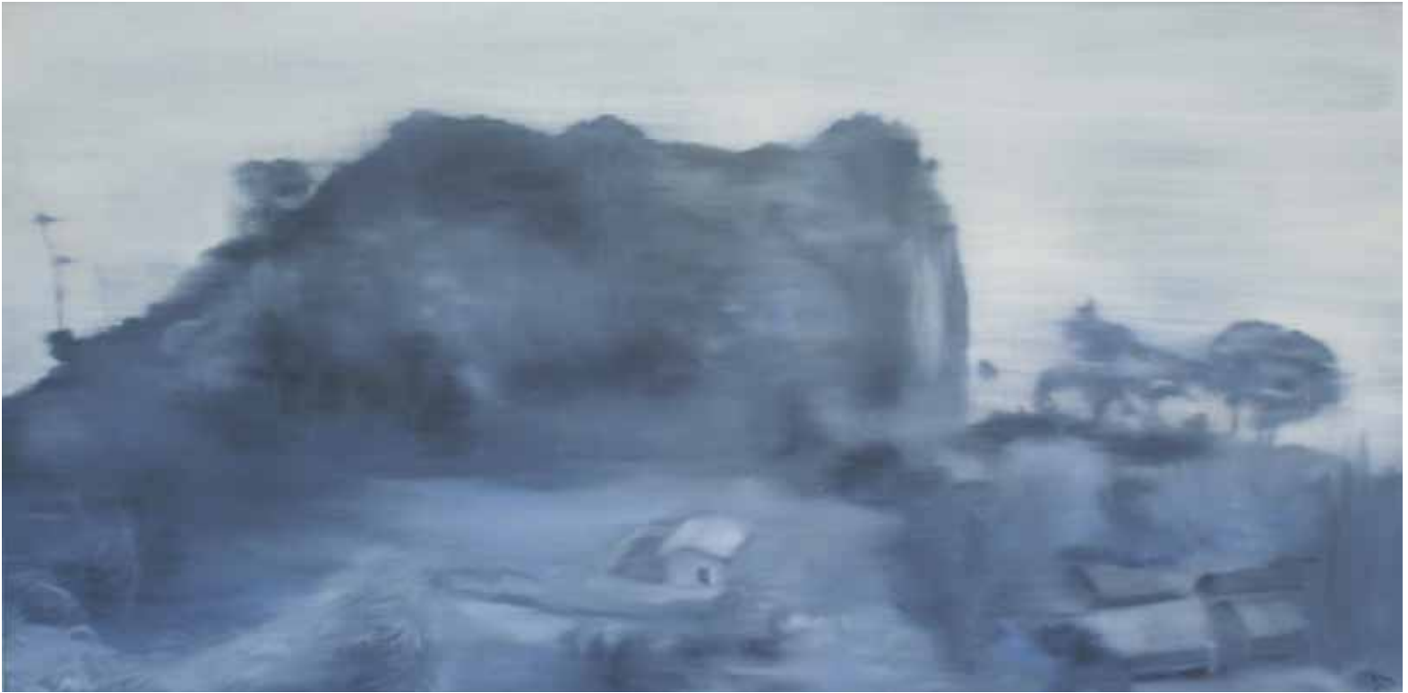
Meo Vac Blue Moutains, 2011 | Oil on canvas | 199 x 98 cm