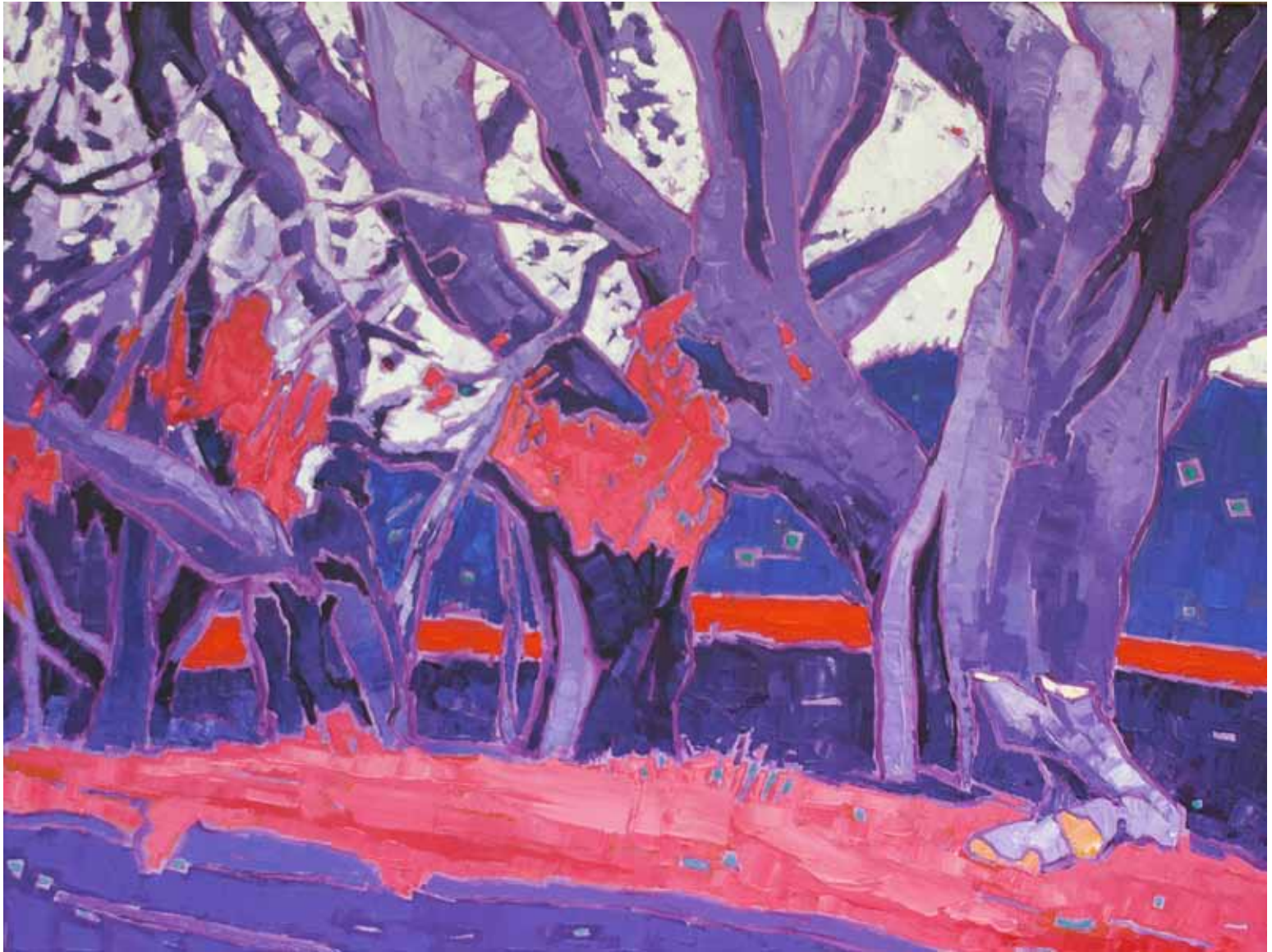
The Grove, 2013 | Oil on canvas | 122 x 92 cm