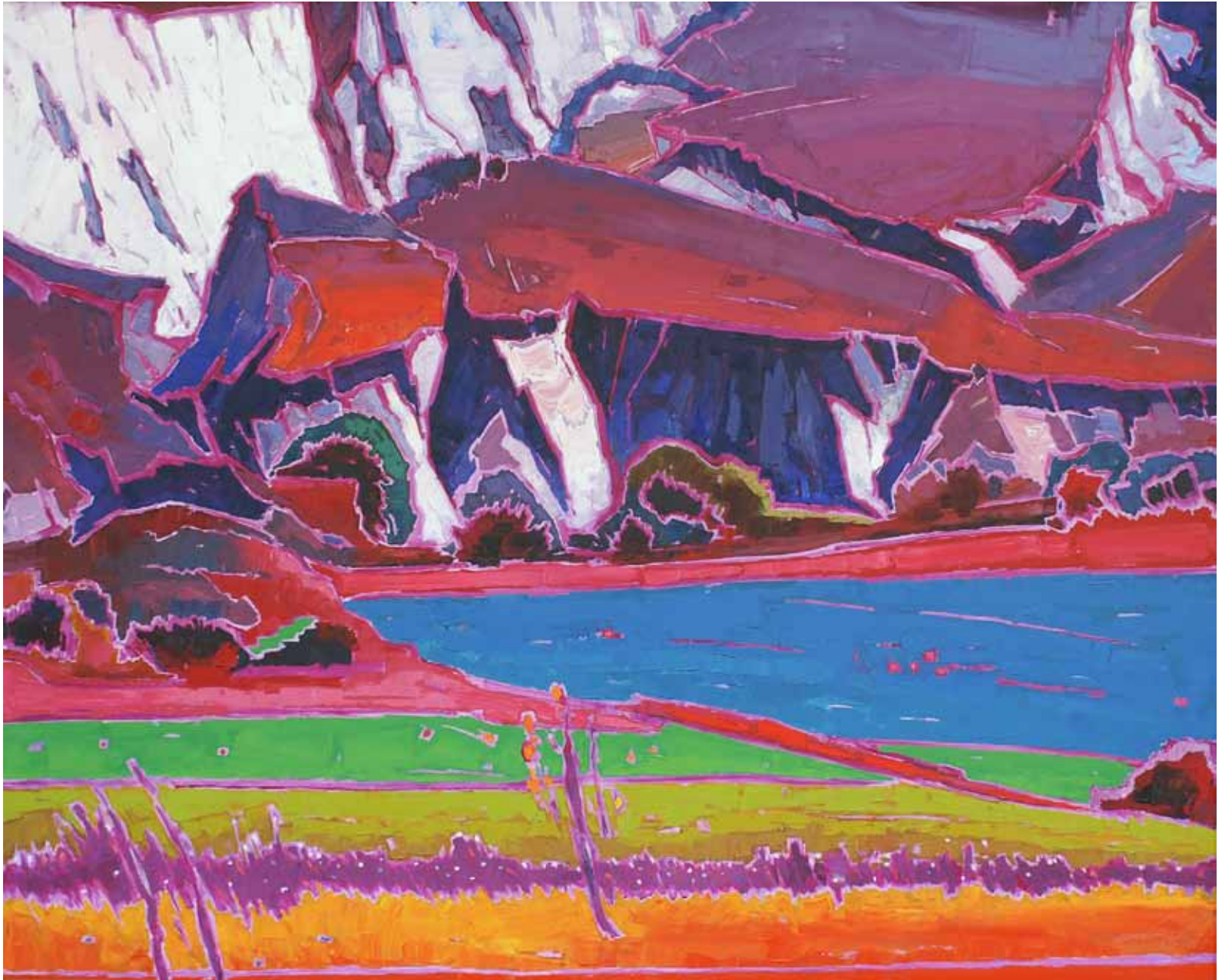
Stark White, 2012 | Oil on canvas | 183 x 122 cm