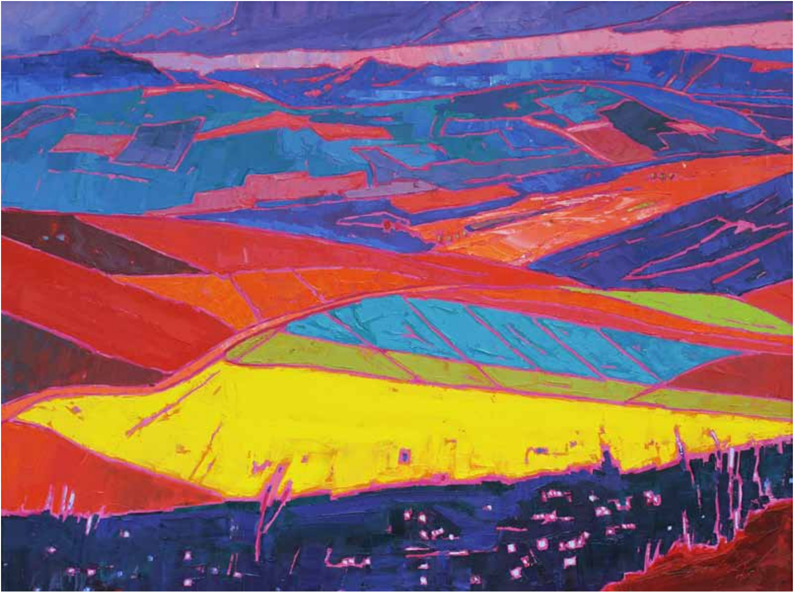
Sunshine Fields , 2013 | Oil on canvas | 122 x 92 cm