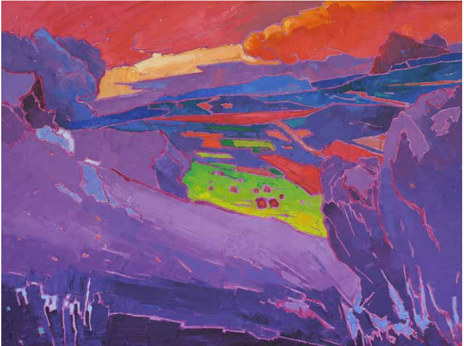
Evening Approaches , 2013 | Oil on canvas | 122 x 92 cm