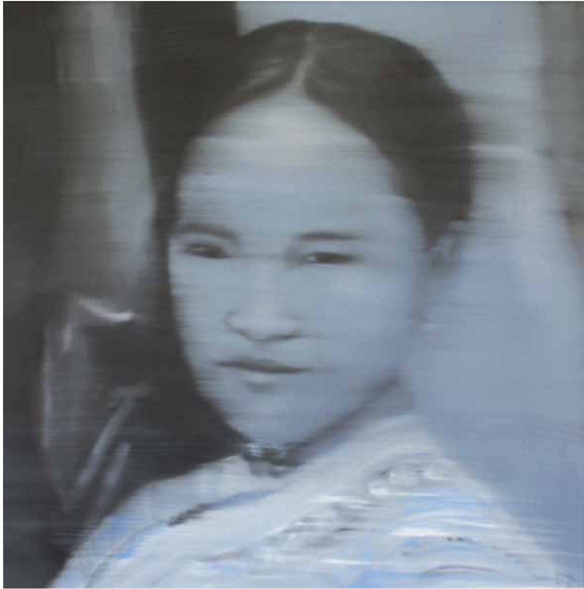
Flower Girl in Bac Ha, 2013 | Oil on canvas | 88 x 88 cm